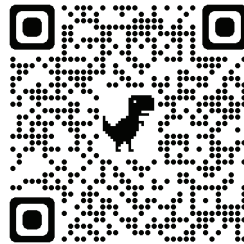
How to Swaddle Bathe in the NICU