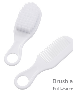
Brush and comb set for full-term infants