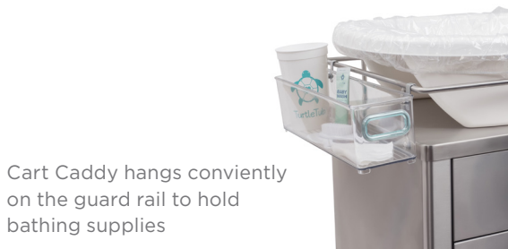
Cart Caddy hangs conveniently on the guard rail to hold bathing supplies