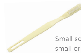
Small scalp brush for small or premature infants