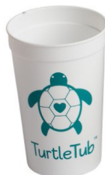
22 oz. rinse cup