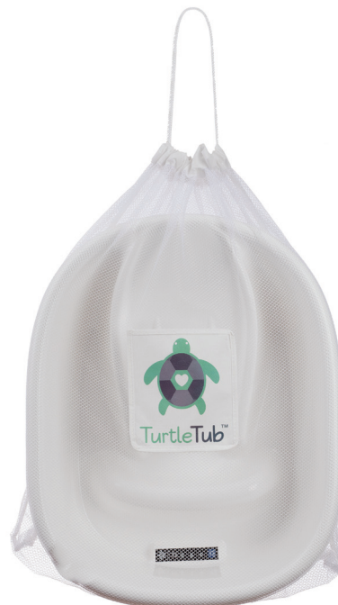
Mesh storage bag to hang, dry and store the TurtleTub