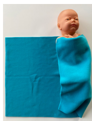
2. Put the infant's hands near her face for comfort and fold one side of the blanket over the infant.