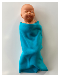
3. Fold over the other side of the blanket.