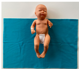
1. Position the blanket horizontally and place the infant on the blanket.

The goal of the swaddle blanket is to keep the infant warm and comforted throughout the bath. The swaddle should be loose enough to easily expose one extremity at a time for washing. Swaddling an infant for swaddle bathing is not the same as swaddling an infant for sleeping.